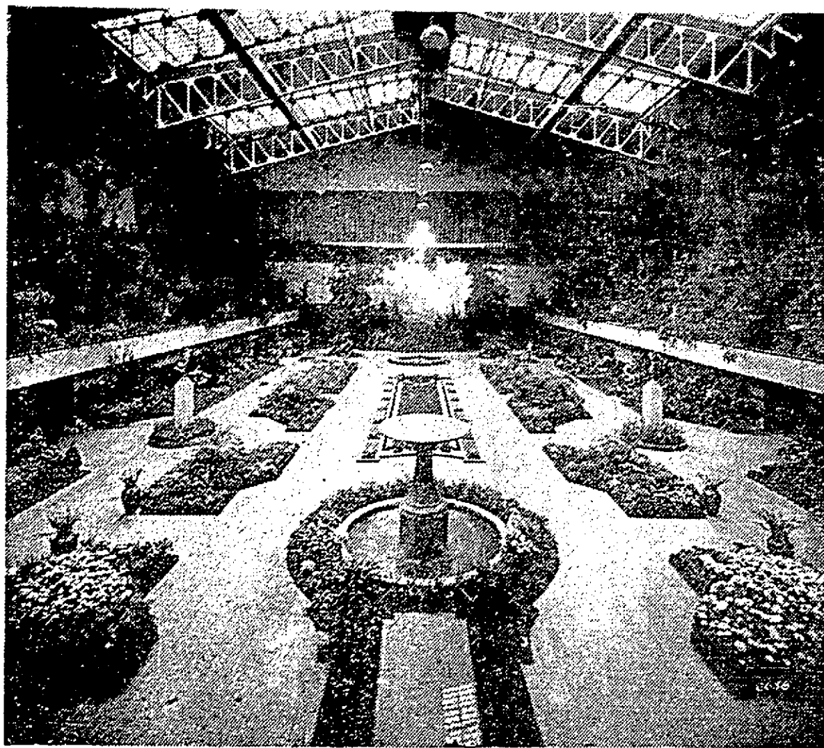
IT ALL STARTED HERE—"Formal Gardens" were featured at the First Annual Spring Garden Show in 1931. Distinctive theme idea is still retained today. Current show ends April 26: